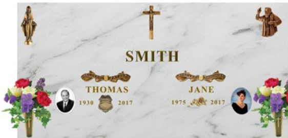
Example of the memorialization options for a Side by Side Crypt

In addition to the inscription of the deceased, families may memorialize crypt fronts with bronze emblems, steel portraits and a floral vase. Please speak with a Customer Sales and Service Representative for more information on the memorialization options available.