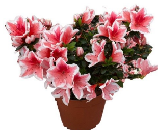
Mother's Day Chapel Plant