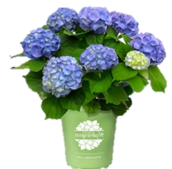
Father's Day Chapel Plant