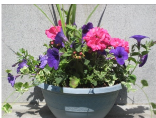
Mother's Day Potted Plant