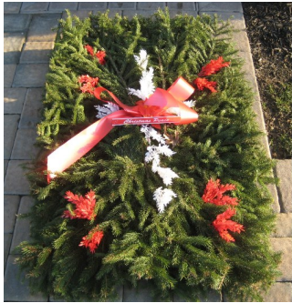
Christmas Blanket or Pillow