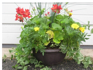
Father's Day Potted Plant