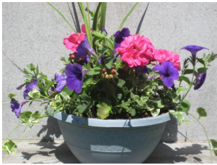
Mother's Day Potted Plant