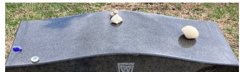
Please don't leave rocks, coins, or other items on top of monuments! They will be removed and discarded.

Rocks, stones, and coins can become dangerous projectiles that get caught up in lawn mowers and line trimmers; they can seriously injure visitors or cemetery workers and cause damage to monuments or car windows. Separately, placing rocks can also cause permanent damage and discoloration to the monument as they release elements that penetrate below the surface of the granite and become bleached by the sun.