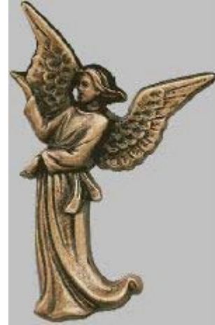
Angel (Left Facing)