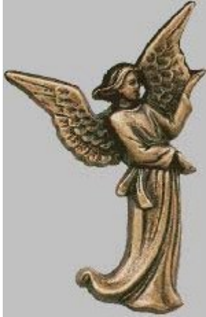
Angel (Right Facing)