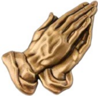
Praying Hands (Left)