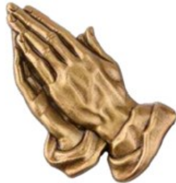
Praying Hands (Right)