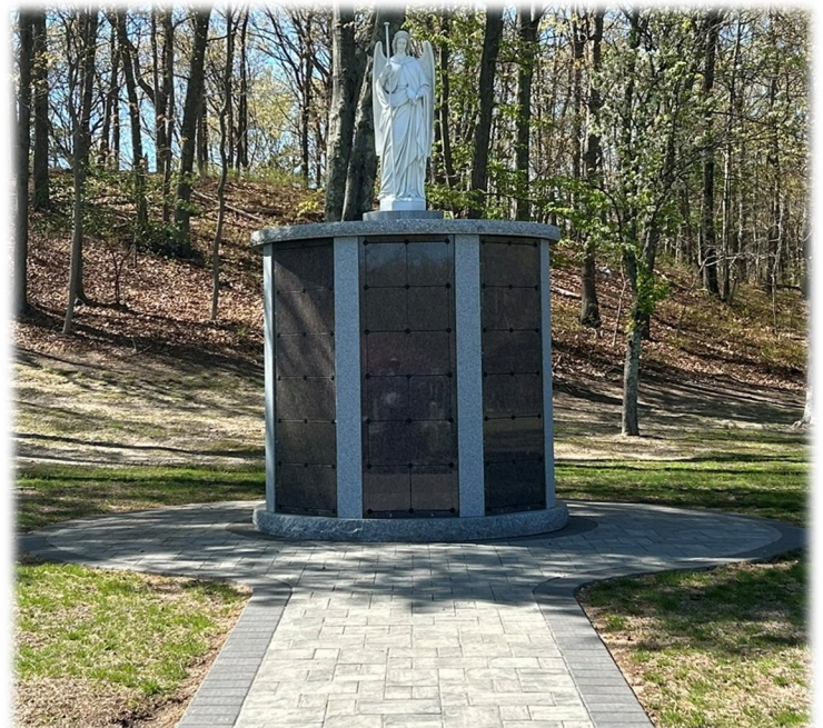
Columbaria niches offer a final resting place in beautiful outdoor settings