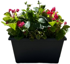
Mother's Day Potted Plant