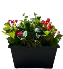
Mother's Day Potted Plant