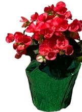
Mother's Day Chapel Plant