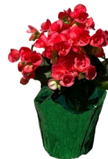
Mother's Day Chapel Plant