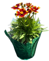
Father's Day Chapel Plant

Please note: Catholic Cemeteries of Long Island reserves the right to substitute decorations of a similar quality and nature, based on vendor availability. For Mother's Day and Father's Day plants, the floral color and exact mix of flowers and containers may vary.