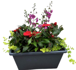
Father's Day Potted Plant