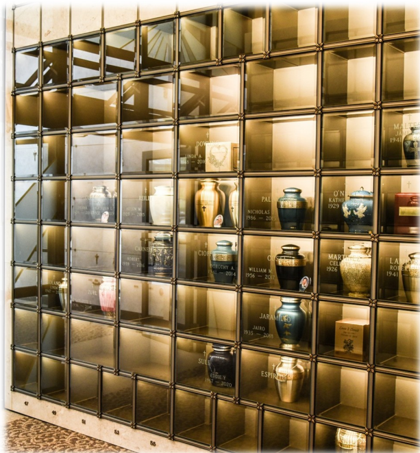
Glass front niches allow families to see the urn of their loved one

Please visit CCLongIsland.org or contact the cemetery office for more information on cremation and available options for your family.