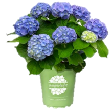
Father's Day Chapel Plant