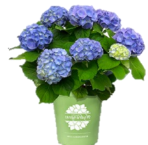
Father's Day Chapel Plant

Please note: Catholic Cemeteries of Long Island reserves the right to substitute decorations of a similar quality and nature, based on vendor availability. For Mother's Day and Father's Day plants, the floral color and exact mix of flowers and containers may vary.