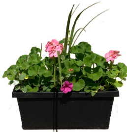
Mother's Day Potted Plant