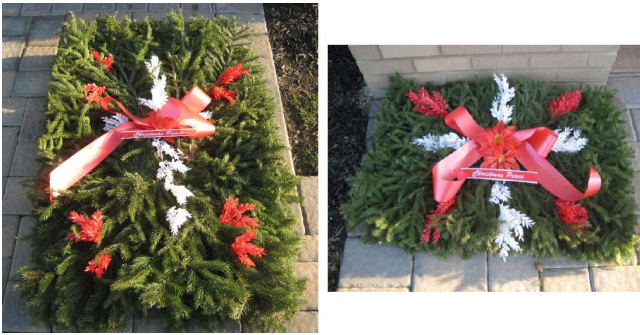
Christmas Blanket or Pillow