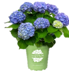
Father's Day Chapel Plant