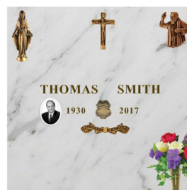
Example of a crypt front featuring bronze emblems, portrait, and floral vase.

When subscribing to the floral vase program , Catholic Cemeteries of Long Island will supply and install an artificial floral arrangement in a vase for a crypt or niche front. New seasonal arrangements will be installed every 3 months for those subscribed to the program. Full details on the program can be found by clicking here .