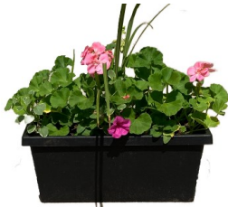
Mother's Day Potted Plant