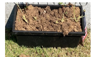
Above are two plants placed for Father's Day at Holy Sepulchre. Pictures on the left show the plants when they were placed. Pictures on the right show those same plants two days later.