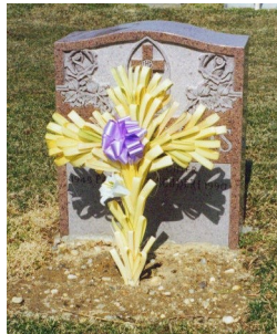
Easter Palm Cross