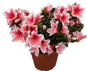
Mother's Day Chapel Plant