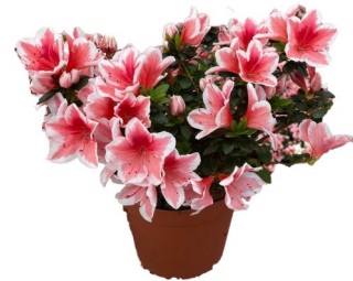
Mother's Day Chapel Plant