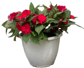
Father's Day Potted Plant