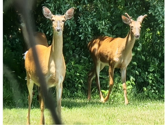
Deer peeking through bushes at Queen of Peace Cemetery

Many of God's creatures love to visit our cemeteries, including deer, turkeys, geese, and groundhogs. For many, the presence of wildlife enhances the serene and peaceful atmosphere of the cemetery, providing moments of mindfulness and connection to nature.