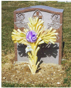
Easter Palm Cross