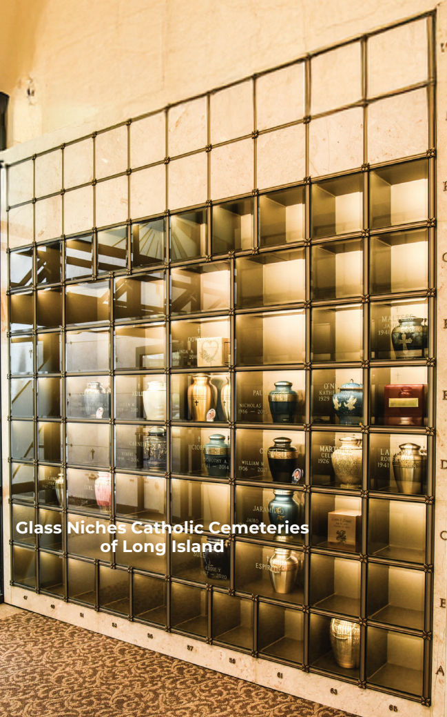
Glass Niches Catholic Cemeteries of Long Island

321 Jericho Turnpike Old Westbury, NY 11568