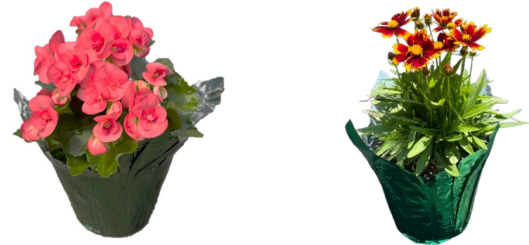
Mother's Day Chapel Plant