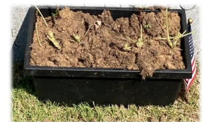
Pictures on the left show potted plants placed at the cemetery. Pictures on the right show those same plants two days later after deer located them!