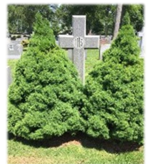
Bushes that are not cared for often obstruct monuments and neighboring plots.

A well-maintained, balanced shrub or bush enhances the natural qualities of the plant, adds to the overall beauty of the family plot and compliments the monument. With regular maintenance throughout the growing season, early detection of growth-related problems is possible. A treated bush can be saved when early detection occurs.