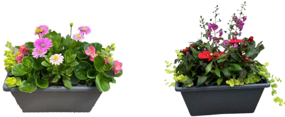
Mother's Day Potted Plant