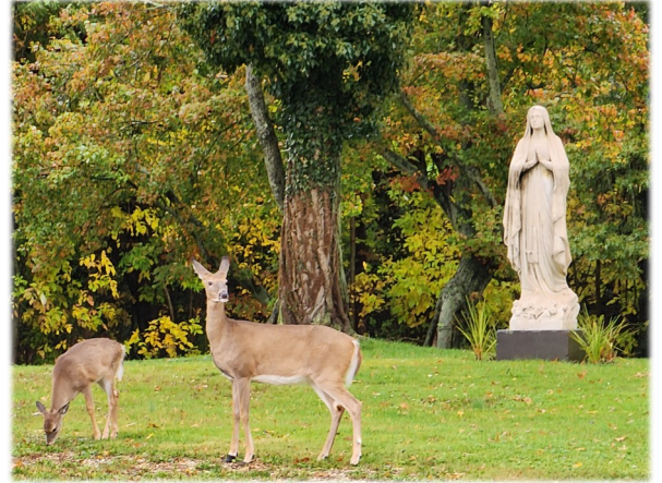
Deer grazing near the statue by the pond at Queen of Peace.

Many of God's creatures love to visit our cemeteries, including deer, turkeys, geese, and groundhogs. For many, the presence of wildlife enhances the serene and peaceful atmosphere of the cemetery, providing moments of mindfulness and connection to nature.